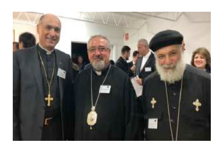
Photographed during the dinner: L to R:

He spoke on the topic "The Armenians: Past, present and future in Diaspora, Australian context"