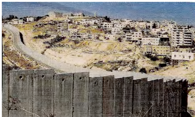
An eight-metre wall has made Bethlehem an 'open prison'.

Christians comprise about 2% of the population of Israel. Their numbers are decreasing in such Christian centres.