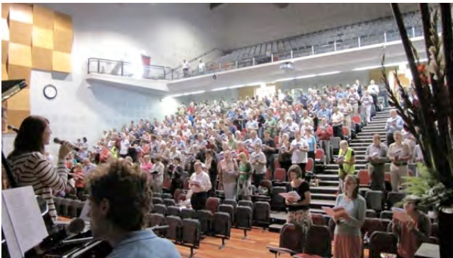
CGGGS Convention Forum

It was an uplifting and joyful experience to participate in the carefully crafted liturgies and the rousing singing shared with enthusiasm with people of many different churchmanships.